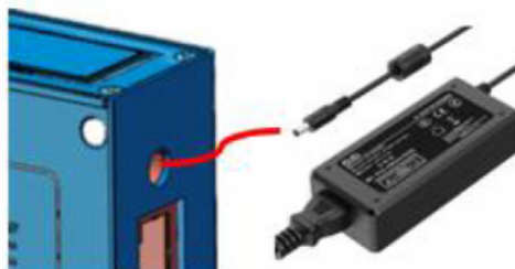
Figure Connecting the power supply through the independent power supply interface.

Via D-SUB9 connector users can also turn on the machine according to the power supply through D-SUB9 connector.