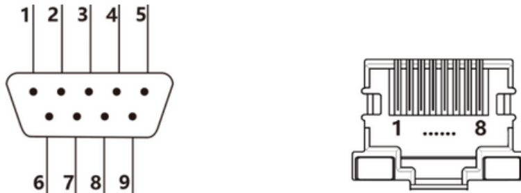
Figure D-SUB9 and RJ45 device end pin number

The line sequence is defined as follows: